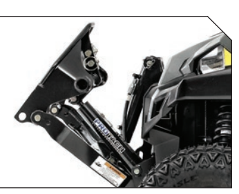
Pro-Tach™ Attachment System

This is where BRUTUS goes from best-in-class to a class all its own. For the first time in a side x side utility vehicle, BRUTUS delivers full, front-end PTO capability. This revolutionary integrated system delivers power directly from the vehicle's engine to drive a complete line of purpose-built, out-front commercial attachments. The result is productivity never before seen in its class.