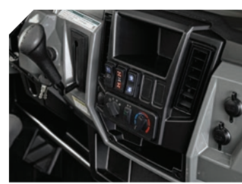
All-Season Climate Control