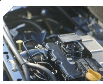
24-Horsepower Diesel Engine

Just as important as what's underneath this hard-working, multi-purpose vehicle is what you can pull behind it. With the strength to tow 2000 lb and a cargo box payload capacity of 1250 lb, you can move more in fewer trips and in less time.