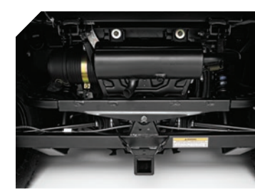
Multi-Link Coil Over De Dion Rear Suspension