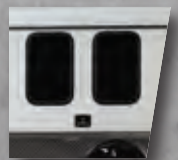
GEM® MAX BOX