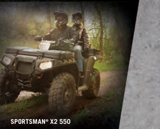
SPORTSMAN® X2 550