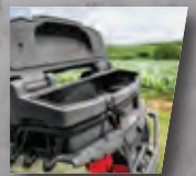
SPORTSMAN® LOCK & RIDE® REAR CARGO BOX