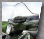
SPORTSMAN® LOCK & RIDE® WINDSHIELD