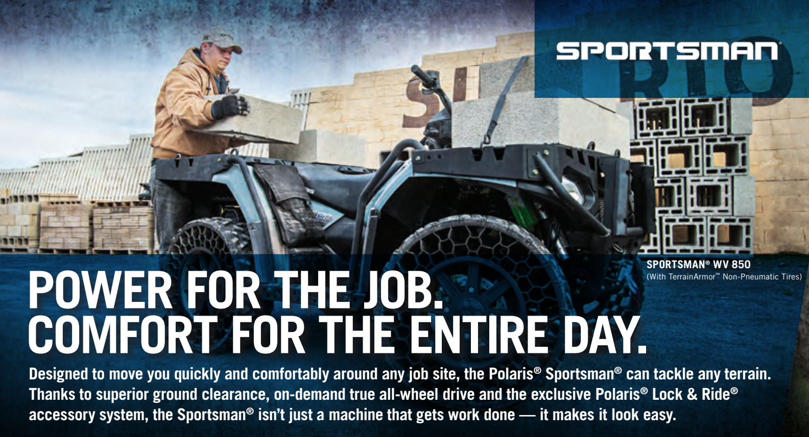
SPORTSMAN® WV 850 (With TerrainArmor™ Non-Pneumatic Tires)