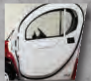
GEM® HARD DOORS