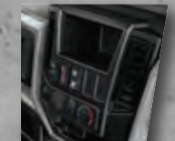
ALL-SEASON CLIMATE CONTROL

Available in-dash heat, defrost and air conditioning work in conjunction with a fully-enclosed, factory-installed cab to keep the operator comfortable, and thus more productive, in a variety of weather conditions.